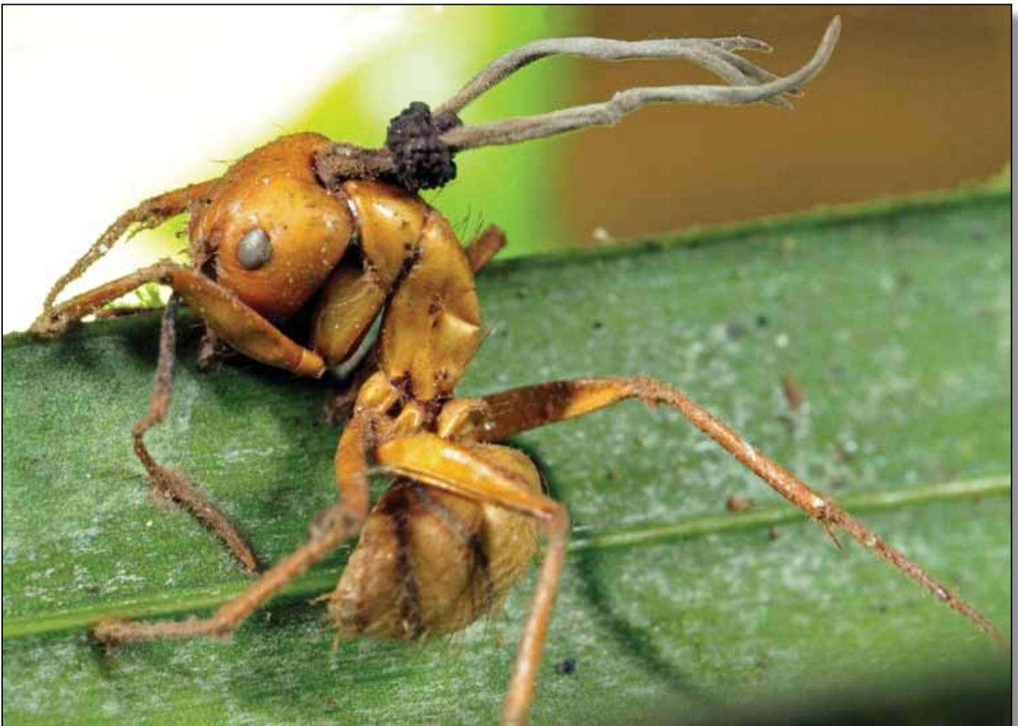
A carpenter ant carcass killed by Ophiocordyceps camponoti-balzani . Photo courtesy D. Hughes.

Giove, C. 2011. New Yorkers paying $800 an ounce for worms that promise sexual prowess. The New York Post ,