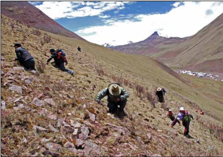
Tibetan collectors searching the ground for the tiny brown fruiting bodies of Yartsa gunbu . In the background a collectors' camp used for six weeks in Da Nge Valley 4700m (14,600ft) in Zadoi County, Yushu, Qinghai.

than climbing a steep slope at 15,000 feet while searching for a the elusive caterpillar fungus as gales, laden with icy sleet, threaten to knock you off your feet. But the media, ever subservient to their readers and their low instincts needs a powerful hook. And, crime laced with a bit of sex fills that role smugly. Where is the sex in this some might wonder? Caterpillar fungus is regarded as a powerful aphrodisiac in East Asia, and that is not just a recent fabrication. When I asked Jakob Winkler, my twin brother, to translate the oldest text on Yartsa gunbu (Winkler, 2008)—as the name of caterpillar fungus is properly transcribed from Tibetan—authored by the Tibetan doctor Zurkhar Nyamnyi Dorje in the second half of the fifteenth century, the heading reads “An Ocean of Excellent Aphrodisiac Qualities” and the text started with: