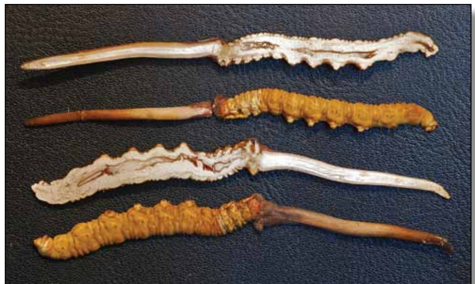
Two Yartsa gunbu /caterpillar fungi sliced open. Note how the whole inside is completely taken over by the mycelium. The darker coloration is remnants of the larval digestive system.