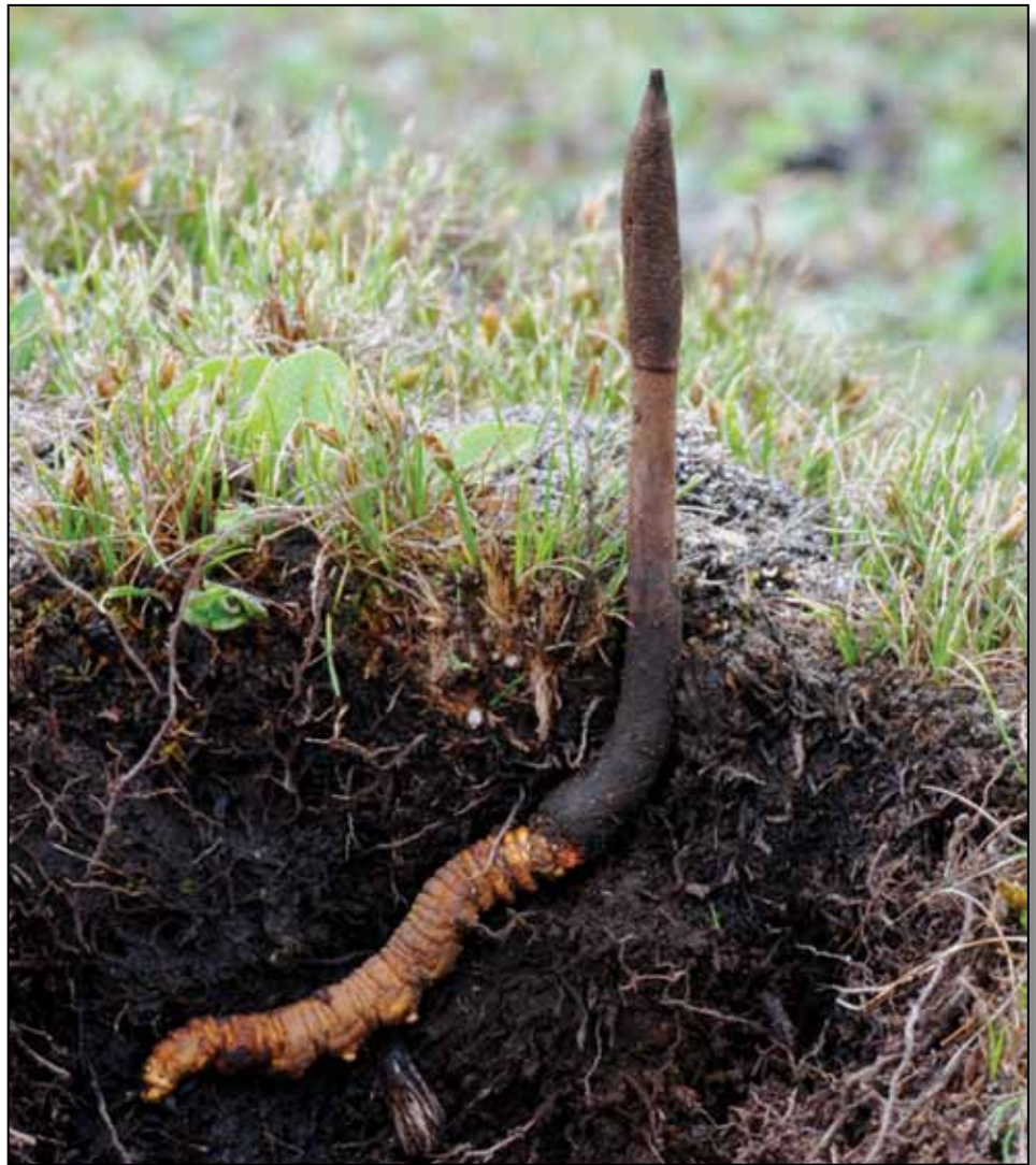
A Yartsa gunbu /caterpillar fungus consisting of the parasitized ghost moth larva and the fruiting body of Ophiocordyceps sinensis . The fruiting body is mature and just started to sporulate. 4300m / 13,300 ft Dechen Tibetan Autonomous Prefecture, Yunnan Province.

The idea [was] to use Cordyceps against multiple sclerosis, an autoimmune disease, since Cordyceps must outwit the immune system of the ghost moths it feeds on in the Highlands of Tibet.