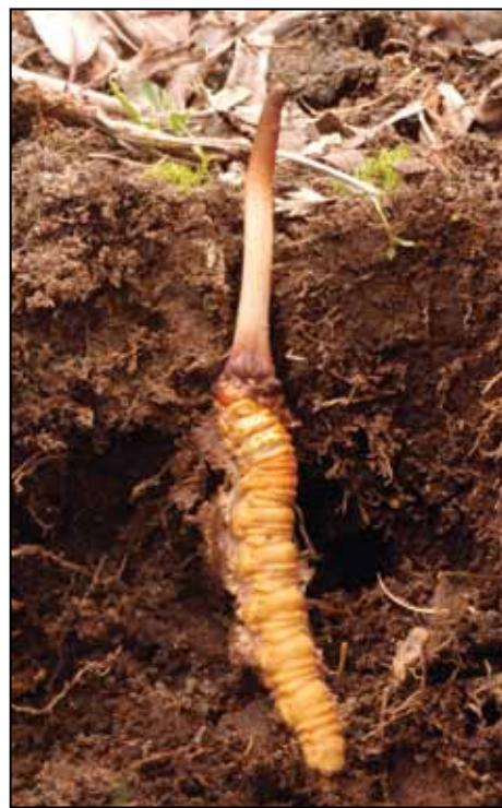
A fresh Yartsa gunbu /caterpillar fungus consisting of the parasitized ghost moth larva and the fruiting body of Ophiocordyceps sinensis . The fruiting body is just emerging from the ground and darkens with exposure. It does not produce spores in this stage, but is most sought after. 4400m/13,600 ft Nagchu, Nagchu Prefecture, Tibet Autonomous Region.

Furthermore, in interviews I carried out in cooperation with the Worldwide Fund for Nature, WWF, to study the sustainability of the current harvest, it was repeatedly pointed out to me by the collectors that the harvesting is getting harder and harder. Because of increased collection pressure everybody has to walk further and to look harder to find Yartsa gunbu . What worried me most was that seasoned collectors told me that sites, that some decades ago used to have a hundred or more caterpillar fungi growing closely together, were now devoid of Yartsa gunbu . These reports made me rethink my previous position that Yartsa gunbu is very resilient to collection, a perspective supported by several hundred years of continued collection.